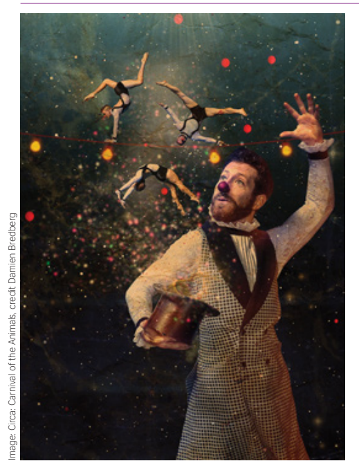
Circa: Carnival of the Animals House of Oz, King's Hall, Edinburgh Festival Fringe, 15-28 August 2022